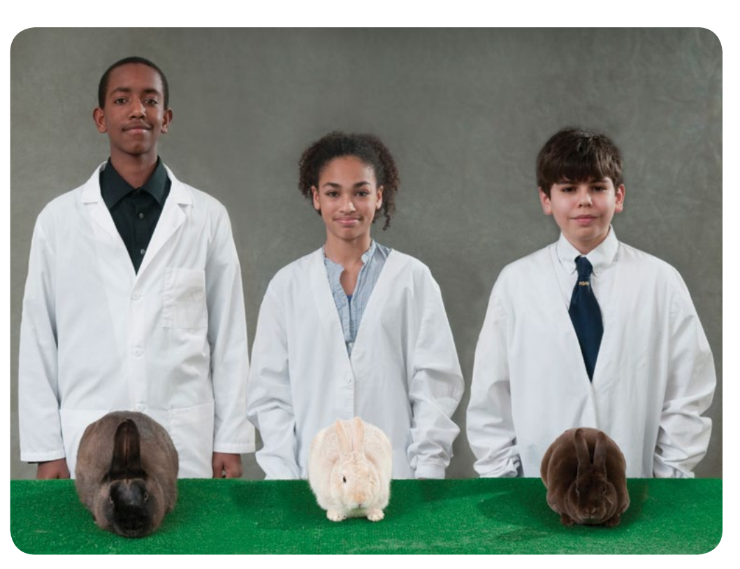
Figure 14. Posing your rabbit facing the judge