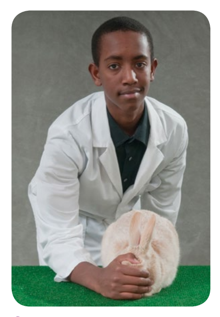
Step 1. Cover the rabbit's head and eyes with your hand.