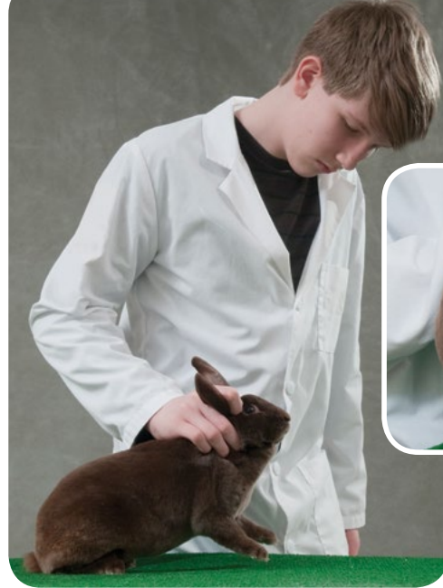
Figure 10. (Step 3) Lifting your rabbit

Use your other hand to support the rabbit's lower hindquarters (see fig. 11), OR gently place one hand under the chest and the other under the rump.