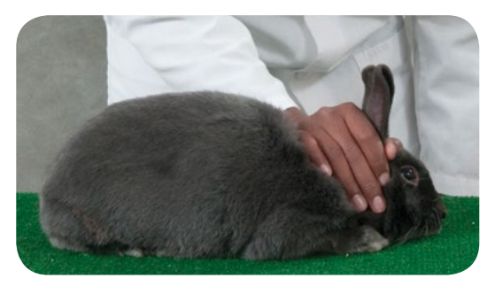
Figure 8. (Step 2) Holding your rabbit — Option B