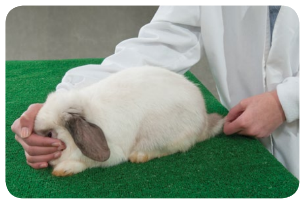
Step 6. Set the tail so that it is not underneath the rabbit.