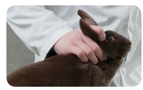
Figure 9. (Step 2) Holding — Option C