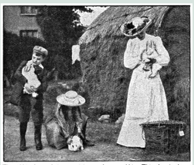
The rabbit class. Judge examining an Angora rabbit. This class is always a popular and well-filled one

The first rabbit agricultural society, the British Rabbit Council, was founded in Great Britain in the mid 1930s. Fanciers had been developing specific breeds since the mid 1800s, though, and had begun holding rabbit shows in the late 1800s. The Council worked to guide breeding, supervise rabbit clubs and register rabbits throughout Great Britain.