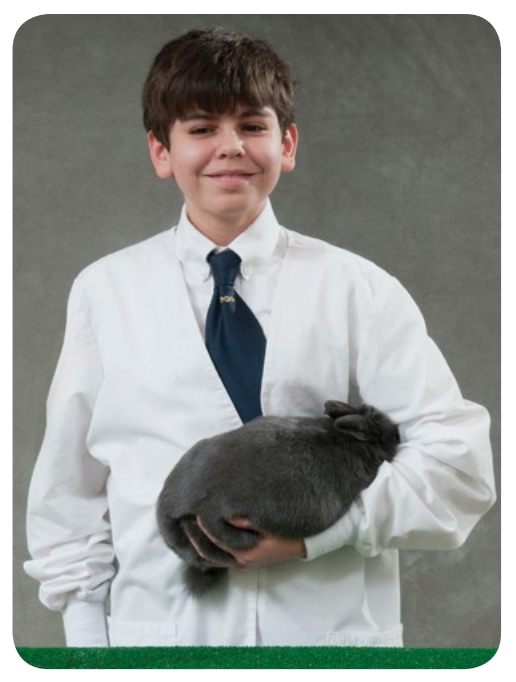
Figure 12. (Step 5) Holding your rabbit

The important thing is not how fast you pick up the rabbit, but whether the judge sees the various steps you use and how well you perform them. However, don't expect the judge to acknowledge each step as you perform it.