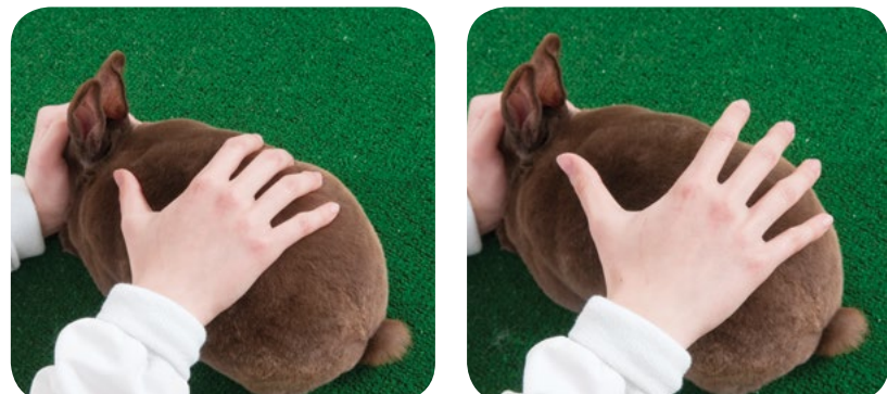
If you have a rex-furred rabbit (above), gently press into the fur to check for resistance.

Examine the fur quality, texture and density by running your hand from the tail to the head and back to the tail (left). If you have a wool breed rabbit, do not run your hand on the animal. Instead, gently fluff the wool from back to front to check the length and condition. Then gently grasp the wool on the sides of the rabbit to check the density.