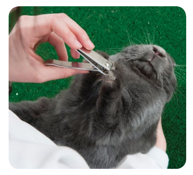
Figure 3. Trimming the rabbit's toenails with a nail clipper.

Condition is defined by ARBA as "The overall physical state of a rabbit in relation to healthy cleanliness, fur, and grooming." (Page 6, 2011–15 Standard of Perfection, ARBA.) The rabbit's condition is a sign of its health, meat and fur qualities. Its breed characteristics will also be considered. The judge will examine each rabbit on the table in a general way.