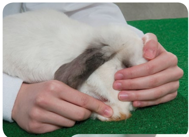
Steps 2. & 3. Set each foreleg even with the eye.