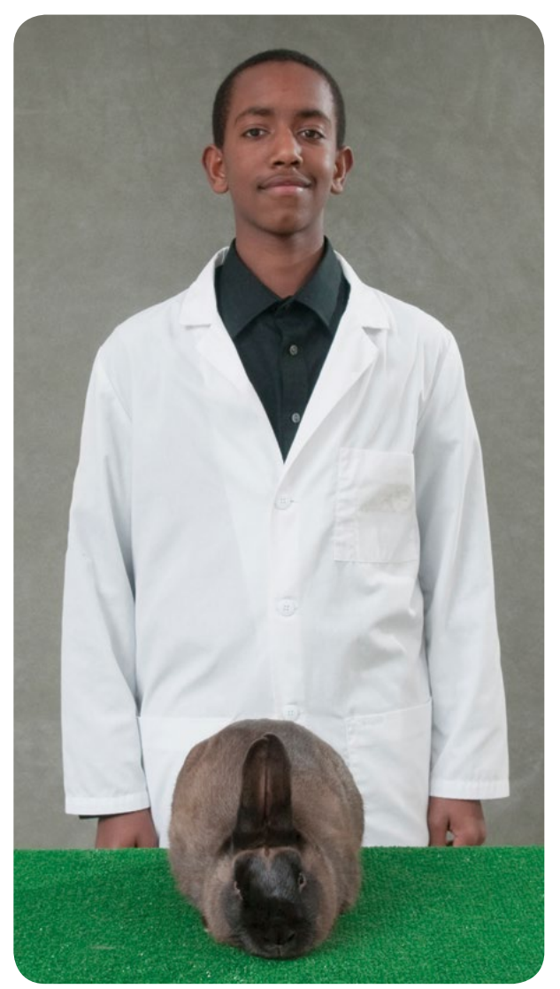
Step 9. Stand back from the table and place your arms at your sides.