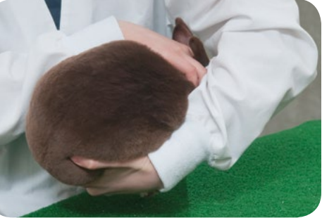
Figure 11. (Step 4) Supporting the rabbit as you lift