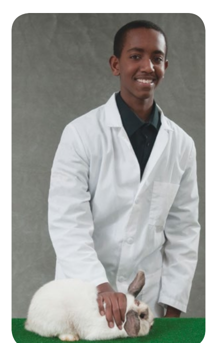
Figure 6. (Step 2) Holding your rabbit.